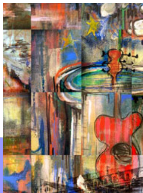
A detail of the 2008 Festival Signature Art by Lee Coburn